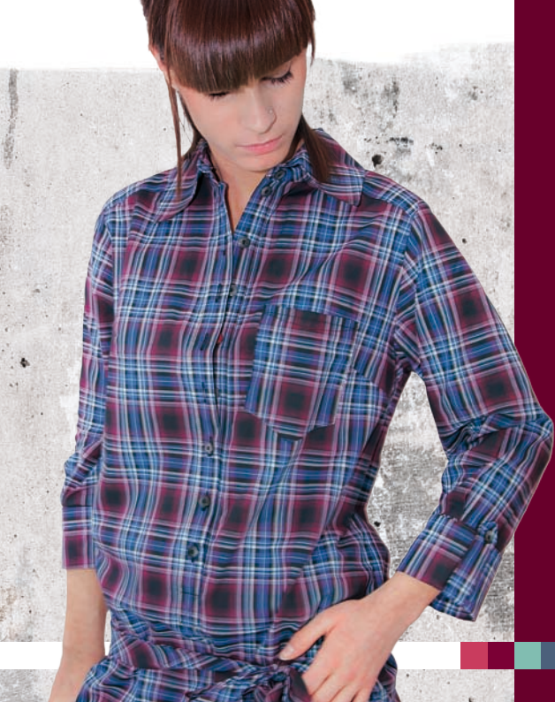
DILLINGER SHIRT (RUMBA CHECK)