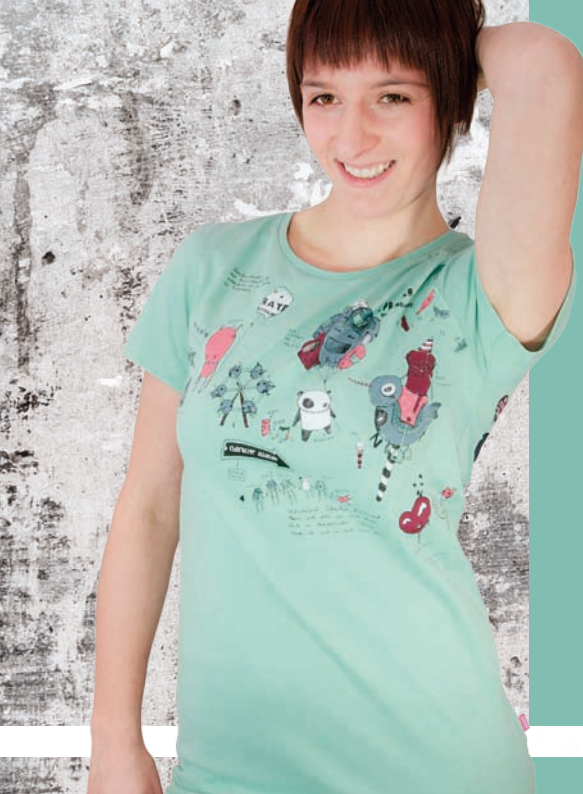
PRATER TEE (DUSTY JADE)