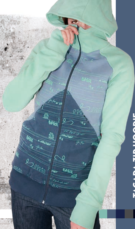
TAGADA ZIP HOODIE (DUSTY JADE)