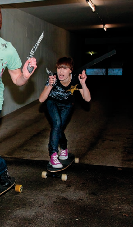
FAIRGROUND TEE (BLACK)